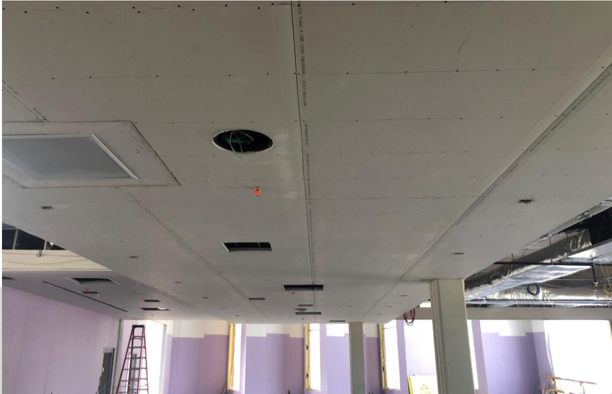
Gypsum Board Progress at Lower Media Center Ceilings