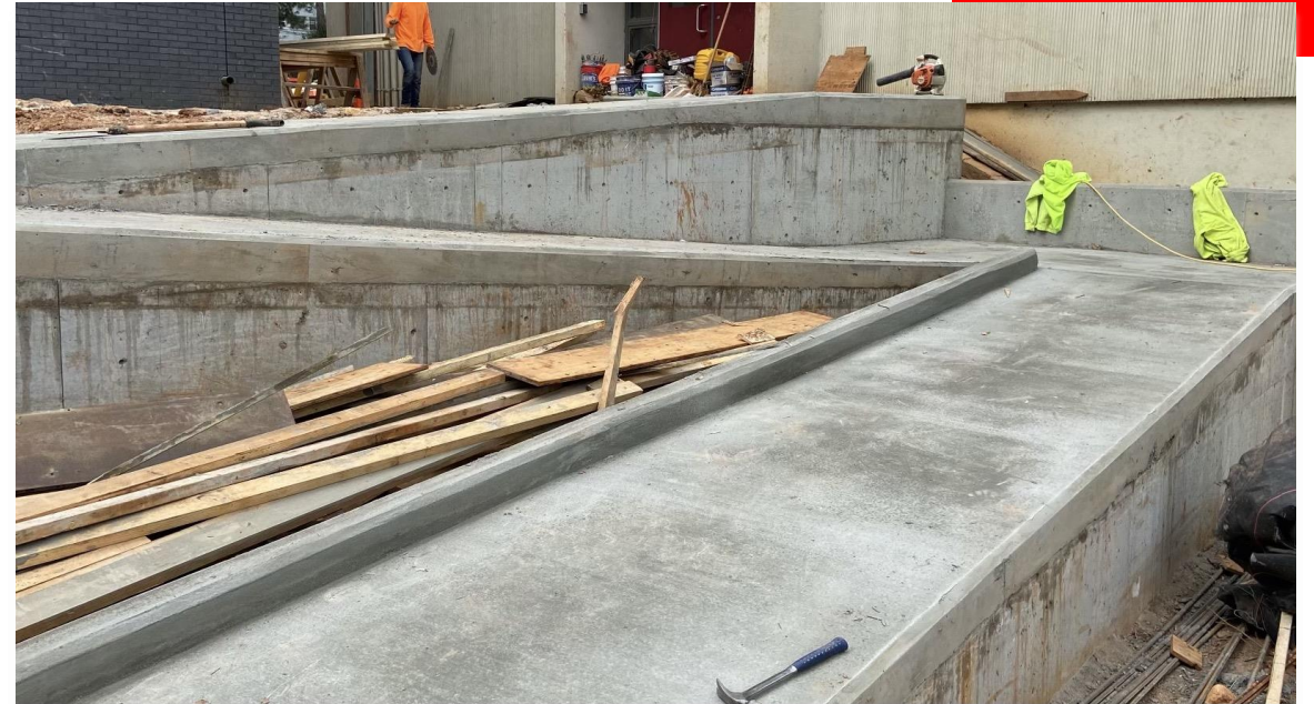
Hardscape Progress East Elevation