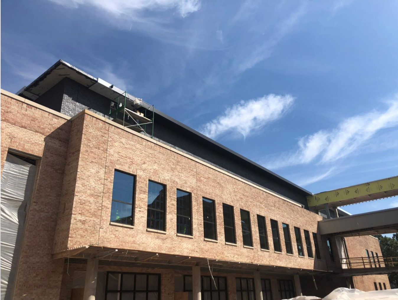
Metal Panel Progress South Elevation