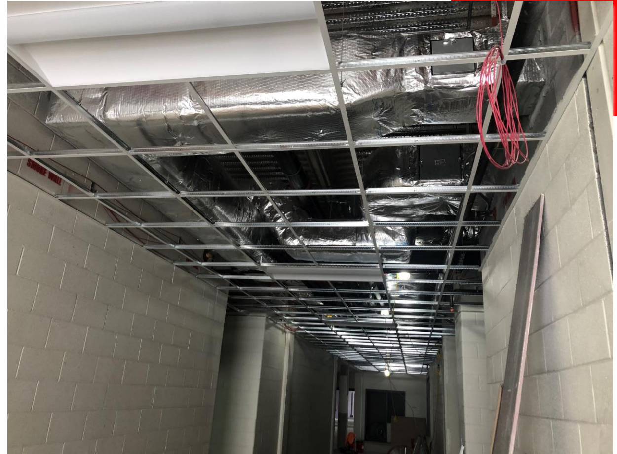
ACT Ceiling Progress 2 nd Floor