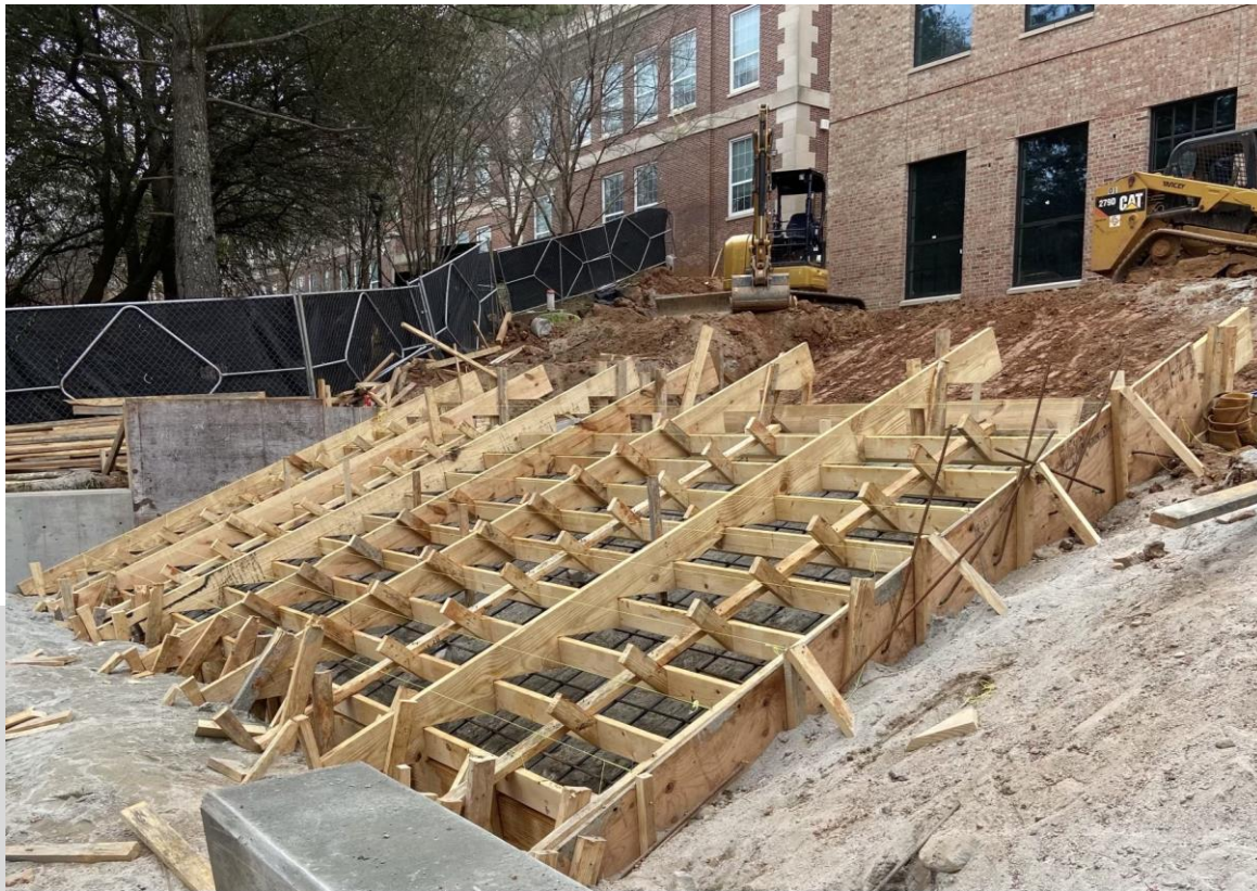
Hardscape Progress East Elevation