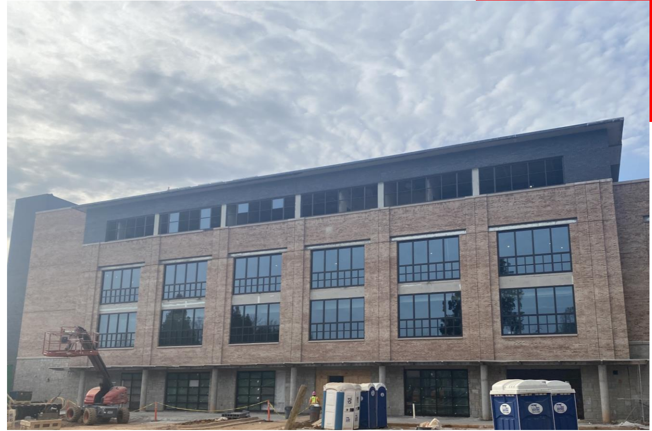
New Addition Progress – North Elevation