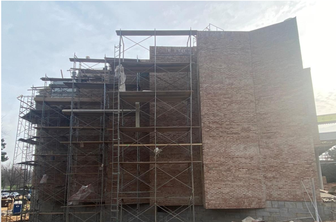
New Addition Progress – West Elevation