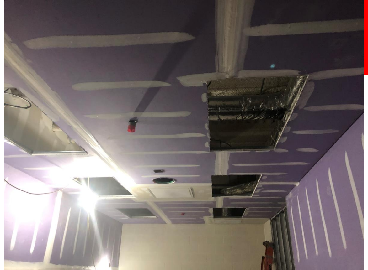
Gypsum Board Progress in Group Restrooms