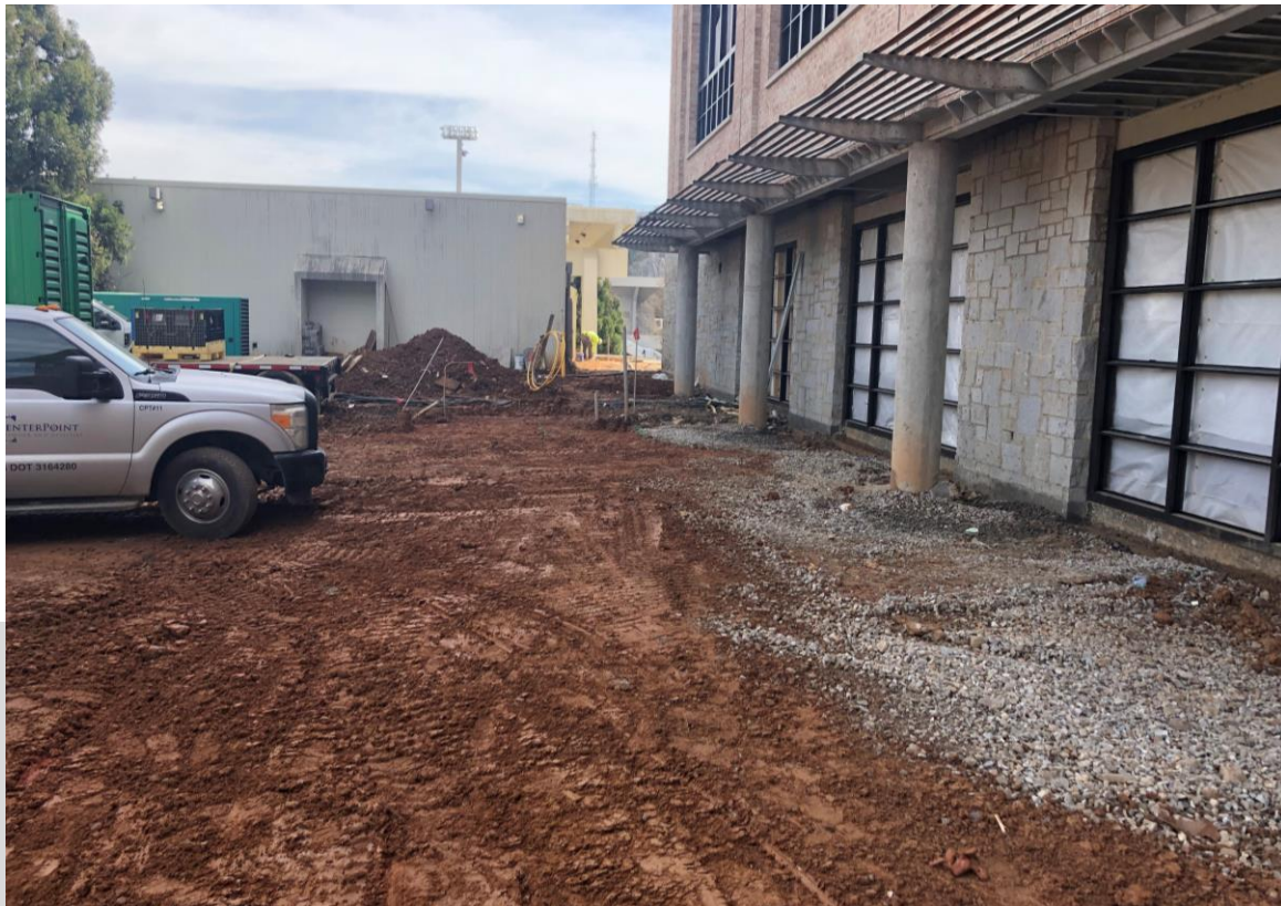
North Elevation Grading Progress